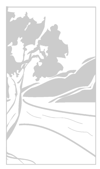
"Your Community Partner in Public Health"