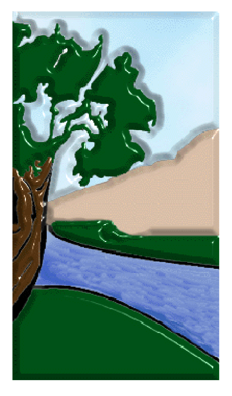
"Your Local Health Department"

The mission of the Branch-Hillsdale-St. Joseph Community Health Agency is to provide quality and accessible local health services with fiscal responsibility.