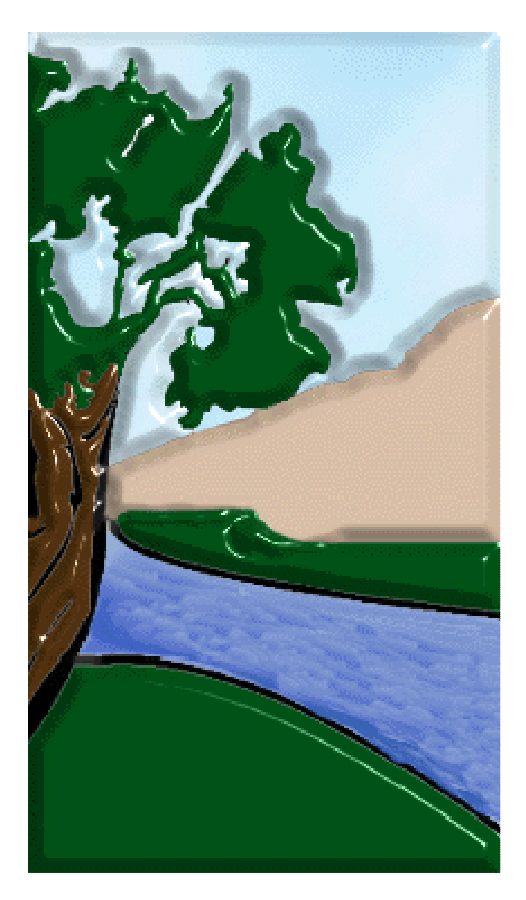
"Your Local Health Department"

The mission of the Branch-Hillsdale-St. Joseph Community Health Agency is to provide quality and accessible local health services with fiscal responsibility.