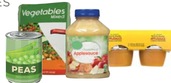
FROZEN AND CANNED FRUITS AND VEGETABLES