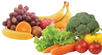
FRESH FRUITS AND VEGETABLES