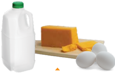
MILK, CHEESE AND EGGS