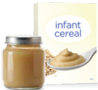
INFANT FOODS: FRUITS, VEGETABLES, MEATS AND CEREAL