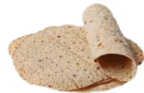
SOFT CORN AND WHOLE WHEAT TORTILLAS