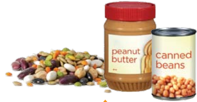
PEANUT BUTTER AND DRY AND CANNED BEANS OR PEAS