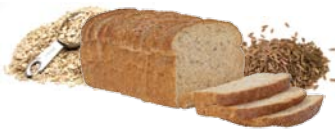
WHOLE WHEAT/WHOLE GRAIN BREAD AND BUNS, BROWN RICE AND OATMEAL